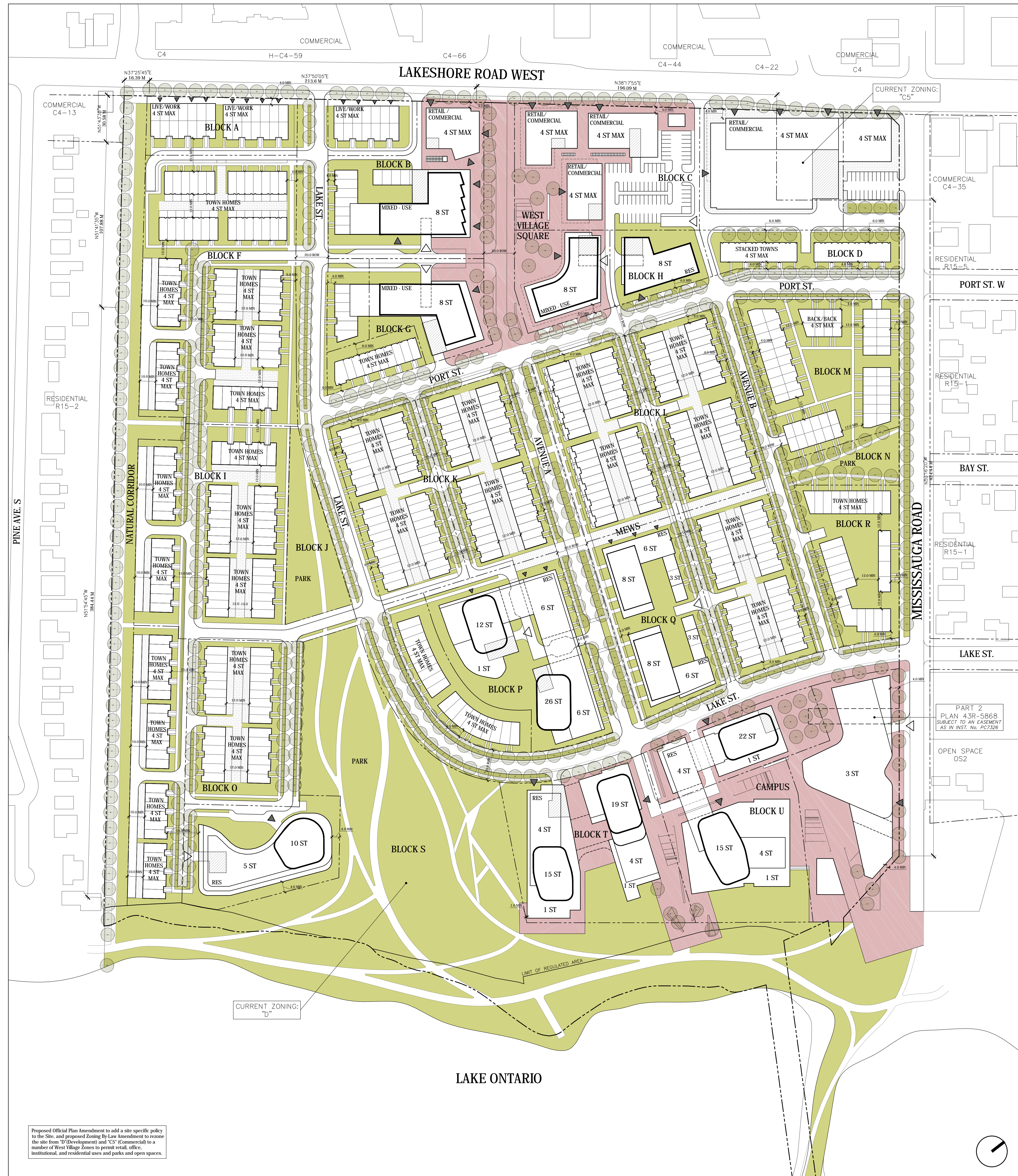
3 STATISTICS A0.02 NTS

Proposed Official Plan Amendment to add a site specific policy to the Site, and proposed Zoning By-Law Amendment to rezone the site from 'T' (Development) and 'C2' (Commercial) to a number of West Village Zones to permit retail, office, institutional, and residential uses and parks and open spaces.